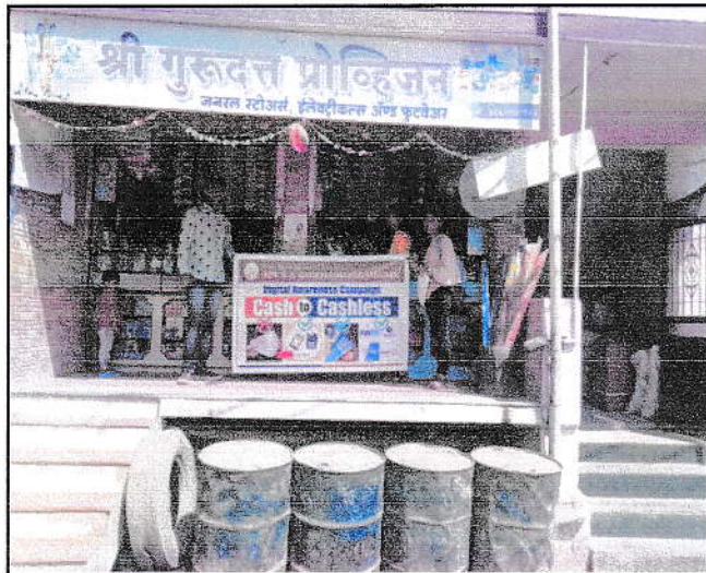
Campaigning at Ringangaon, Tal & Dist. -Jalgaon