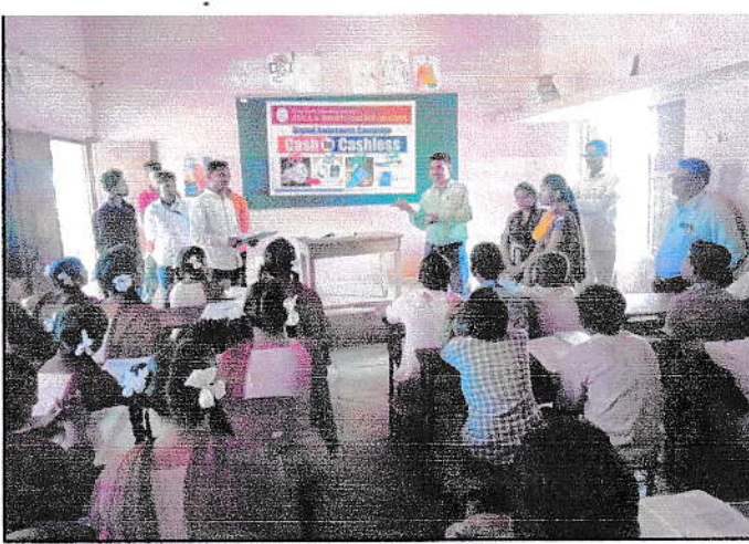
Campaigning in the Classroom at Dhamangaon, Tal & Dist- Jalgaon