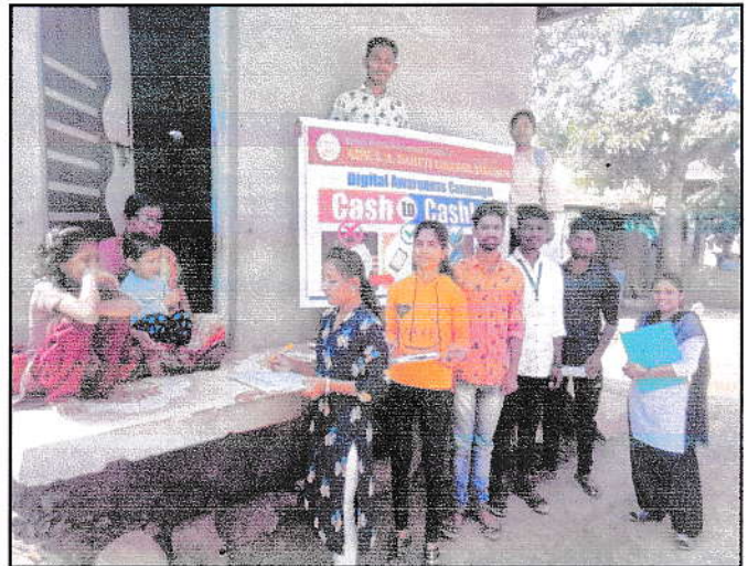
House to House Campaigning