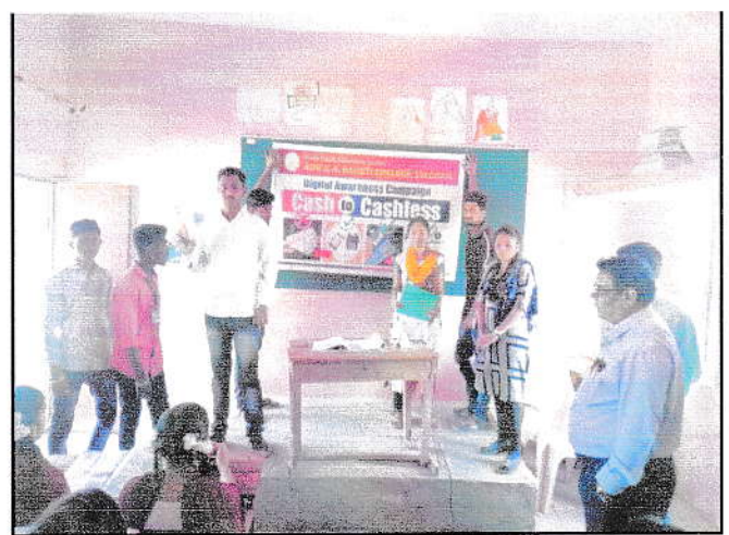
Campaigning in the Classroom at Dhamangaon, Tal & Dist- Jalgaon