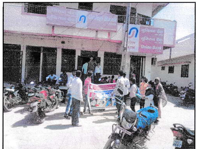
Campaigning at Ringangaon, Tal & Dist. -Jalgaon