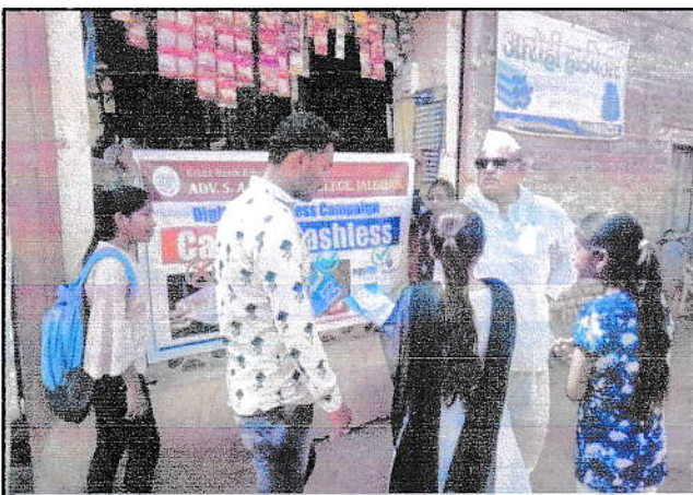
Campaigning at Bambhori, Tal & Dist. -Jalgaon