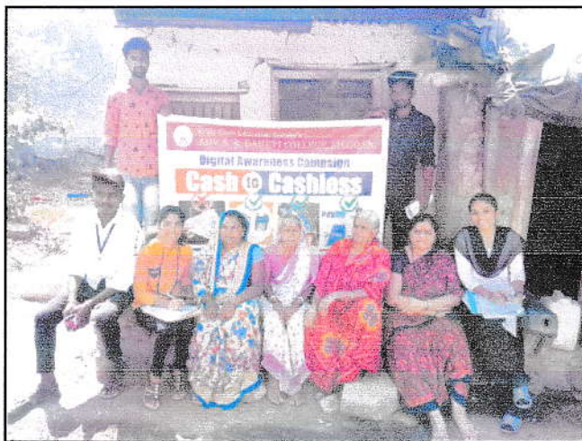
With Housewife Campaigning