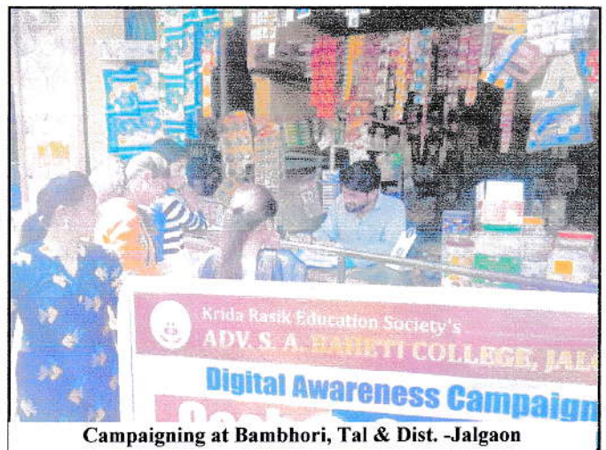
Campaigning at Bambhori, Tal & Dist. -Jalgaon